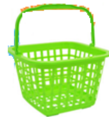
Plastic basket x01

aprox. 30cm X 8cm (to fit in to the small plastic tray -with or without a handle X01)