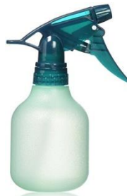
Spray bottle 250-500ml x01