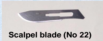
Scalpel blade (No 22)