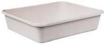
Plastic tray aprox. 45cm X 30cm -01